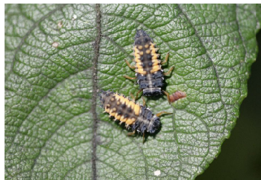
Fig. 5. Larvae of Harmonia axyridis (Pall.)