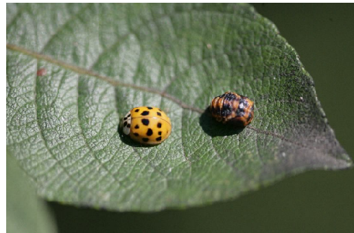
Fig. 3. Imago and pupa of Harmonia axyridis (Pall.)