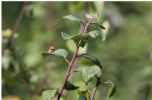
Fig. 2. Imago of Harmonia axyridis (Pall.) on young shoots of cherry plums ( Prunus cerasifera Ehrh.) in Latvia