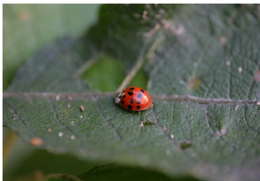
Fig. 4. Imago of Harmonia axyridis (Pall.)