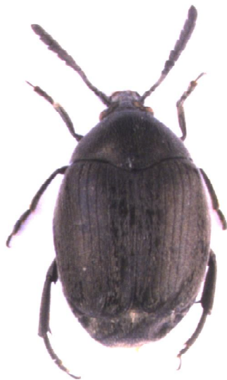
Fig. 1. Spermophagus calystegiae : habitus.