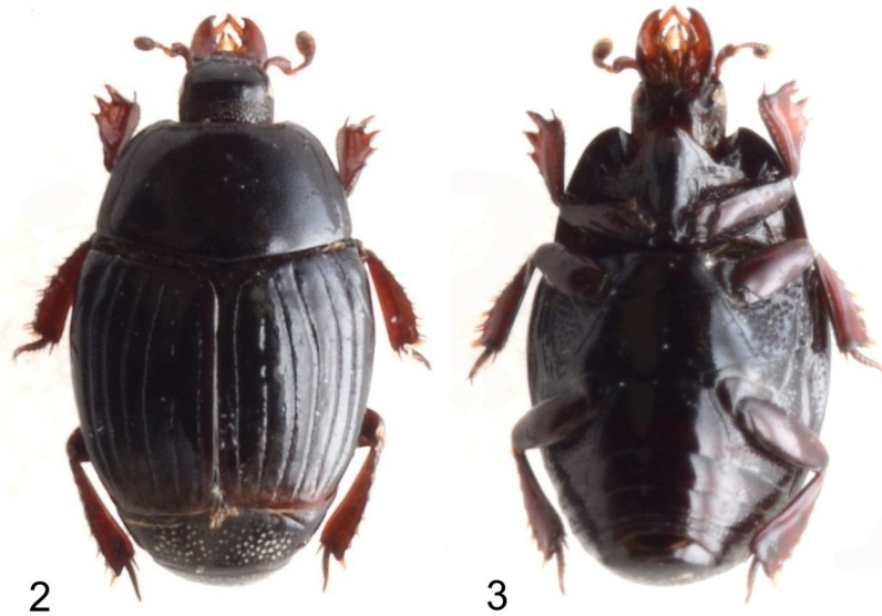
Figs. 2 – 3. Hister arboricavus , 2 – upper side, 3 – under side.