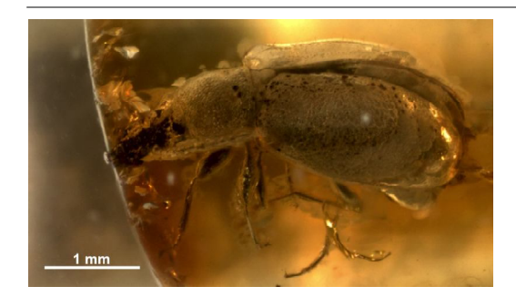
Figure 1. Salpingus henricusmontemini sp.nov. Habitus: dorso-lateral view, left side.