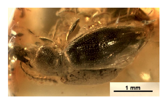
Figure 2. Salpingus henricusmontemini sp.nov. Habitus: dorso-lateral view, right side.