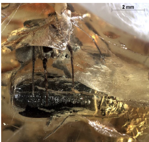
Fig. 2. Curche pauli gen. nov., sp. nov. Holotype. Dorsal view

tarsomere 4 deeply incised; metatarsomere 1 longer than metatarsomere 2 and shorter than metatarsomeres 3–5 combined. Claws appendiculate. Abdomen with eight ventrites, seventh ventrite with U-shaped incision; eighth ventrite greatly reduced in width (Fig. 5).