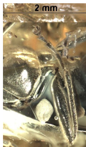
Fig. 4. Curche pauli gen. nov., sp. nov. Holotype. Hind leg