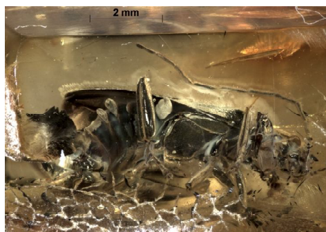
Fig. 3. Curche pauli gen. nov., sp. nov. Holotype. Ventral view

tarsomere 4 deeply incised; metatarsomere 1 longer than metatarsomere 2 and shorter than metatarsomeres 3–5 combined. Claws appendiculate. Abdomen with eight ventrites, seventh ventrite with U-shaped incision; eighth ventrite greatly reduced in width (Fig. 5).