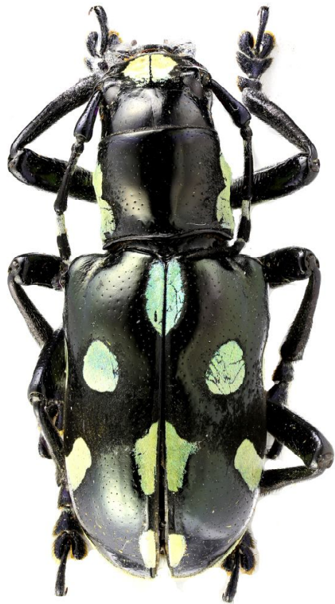
Fig. 6. Habitus of Mimacronia viridimaculata (Breuning) (stat. nov. and comb. nov.) (specimen deposited in DUBC)

https://www.dina-web.net/naturarv ), I came to the conclusion that this variety significantly differs from Acronia alboplagiata by the shape of elytra, but is identical to Acronia novemmaculata , which were described by Hudepohl (1995) from Leyte Isl. (type deposited in SMNS) (Fig. 6). Therefore I propose following taxonomic changes: Mimacronia viridimaculata (Breuning, 1947) stat. nov. and comb. nov. (from Acronia alboplagiata var. viridimaculata Breuning, 1947) and Mimacronia novemmaculata (Hudepohl, 1995) syn. nov. is a junior synonym of Mimacronia viridimaculata (Breuning, 1947).