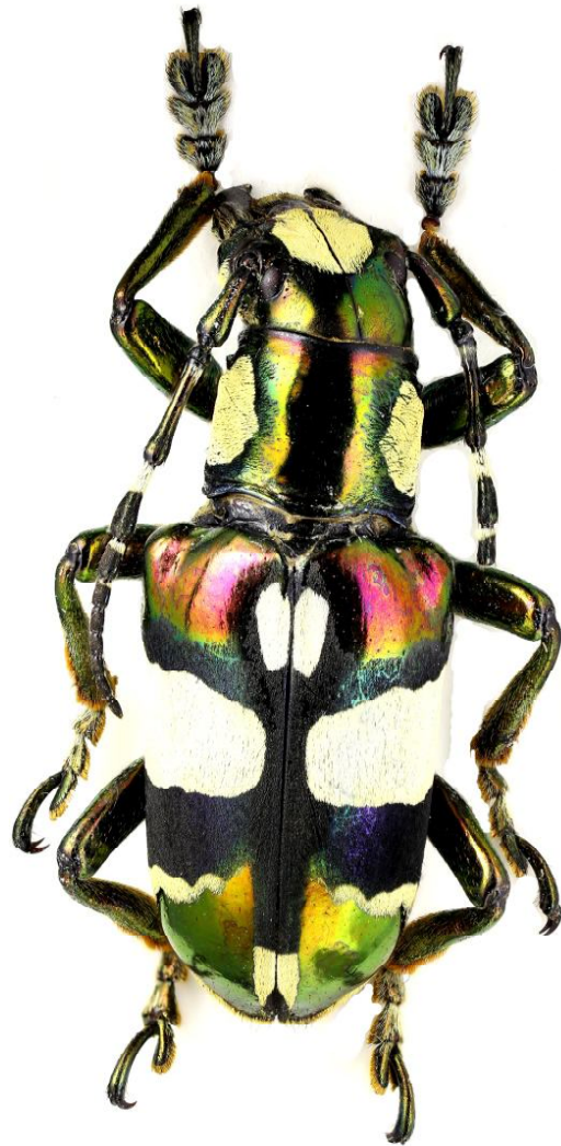
Fig. 2. Habitus of Mimacronia regale sp. n. (holotype)

Elytra convex, with sparse punctures, shiny, with strong golden luster in basal and apical parts, amidst with greenish metallic luster, very fine black tomentum and with pattern of white scales. Each elytron in the middle with wide