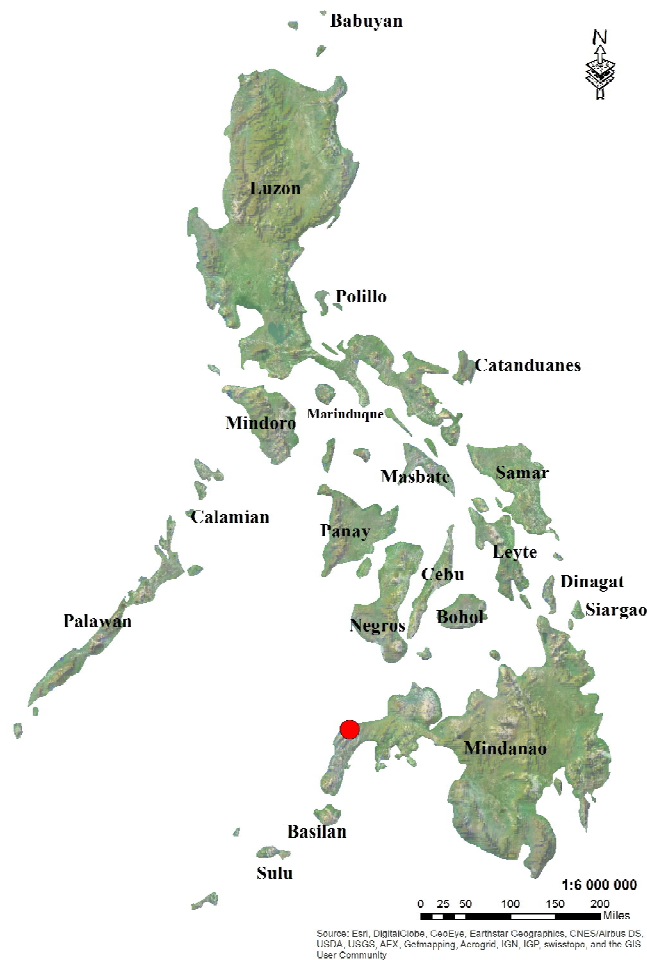
Fig. 1. Distribution map of M. regale sp. n.

The type specimen are deposited in the collection of the Daugavpils University, Institute of Life Sciences and Technology, Coleopterological Research Centre (Ilgas, Daugavpils Distr., Latvia) - DUBC. All specimens have been collected by local collectors.