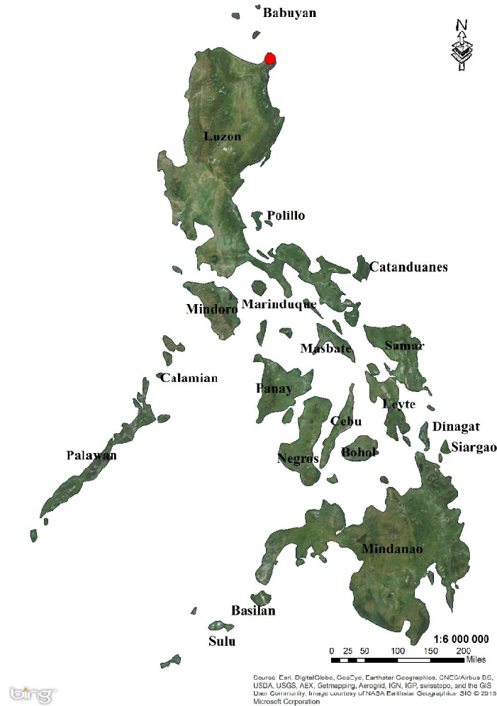
Fig. 2. Distribution of Callimetopus zhantievi sp. n.