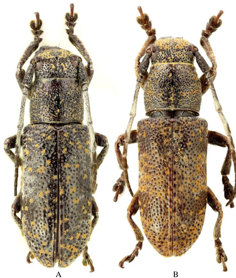
Fig.1. Callimetopus zhantievi sp. n. (A – holotype, B – paratype)