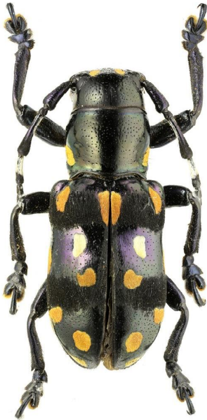
Fig. 1. Acronia streicsi sp.n., holotype

shoulders with wide impression. Elytra mostly covered with black pubescence, each elytron with eight ochre brown and white spots. Elytra at base and at apex smooth, shiny flat, without pubescence. Elytra with elongated ochre brown spot behind scutellum at suture, with triangular white spot behind it dorsally and with ochre brown spot, and in apical portion with oval ochre brown spot and narrow transverse white spot. Lateral portions of each elytron with three ochre brown spots: one between shoulder and hump, one in medio-lateral part of elytra and one larger transverse spot before apex. Apical part of elytra along suture with narrow flat keel-shaped elevation. Apex of elytra without visible projections.