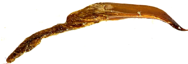
Fig. 1. Aedeagus of A. teterevi sp.n.

Parker, S Cotabato, 12.2013, local collector leg; male: Philippines, MinOdanao Isl., Mt. Parker, S Cotabato, 05.2014, local collector leg (all in DUBC).; male: Philippines, Mindanao Isl., Mt. Parker, 07.2013, local collector leg. [in collection I. & B. Teterev].