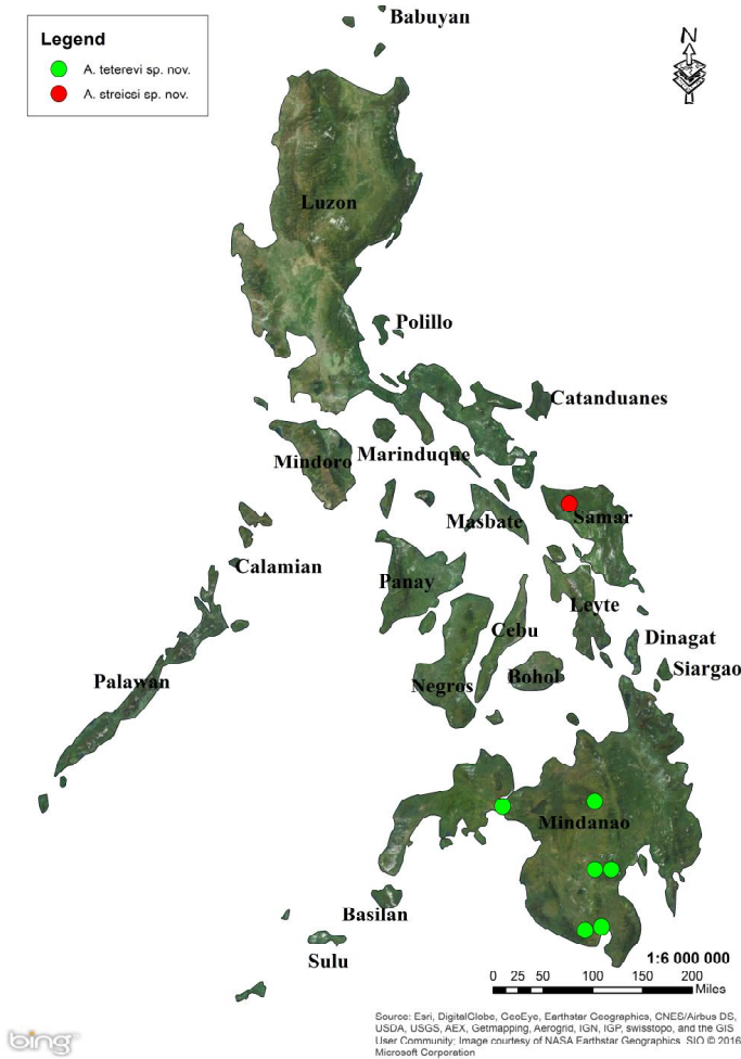
Fig. 1. Distribution of Acronia streicsi sp.n. and A. teterevi sp.n.