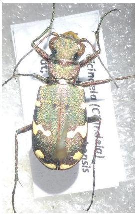
Figure 19. Habitus of Cicindela (Cicindela) talychensis Chaudoir, 1846, dorsal view.