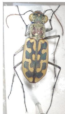
Figure 16. Habitus (dorsal view) of Lophyra (Lophyra) histrio Tschitscherine, 1903.

Bionomics. It was collected near the water using a net. The habitat was very hot and humid.