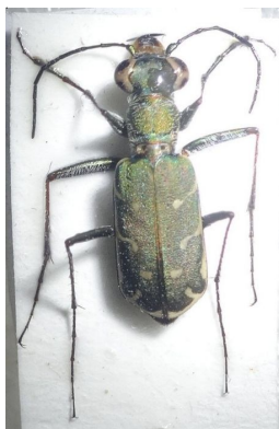
Figure 15. Habitus (dorsal view) of Myriochila (Myriochila) melancholica melancholica (Fabricius, 1798).