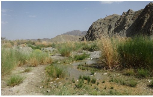
Figure 17. Sistan va Baluchestan province, Nikshahr environs (26°13'07"N 60°12'57"E), 15.IV.2015.