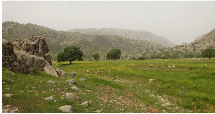
Figure 1. Yasuj province, oak forest (30°29' 18"N 51°28' 45"E), 12.IV.2015.