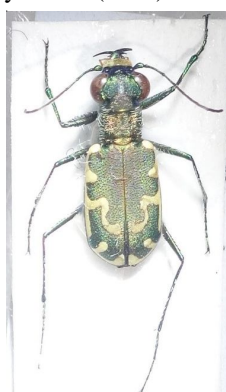
Figure 14. Habitus of Cylindera (Eugrapha) pygmaea laetula (Tschitscherine, 1903), dorsal view.

Distribution. This subspecies was described from Bampur (Sistan va Baluchestan province) by Tschitscherine (1903) and recorded from Iranshahr (Sistan va Baluchestan province, 800 m) by Mandl (1959).