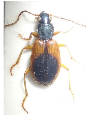
Figure 23. Habitus of Anchomenus (Anchomenus) dorsalis (Pontoppidan, 1763), dorsal view.