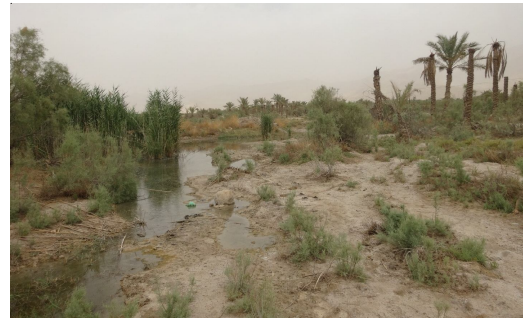
Figure 18. Bushehr province, Borazjan environs, (29°28'8"N 51°16'34"E), 13.IV.2015.