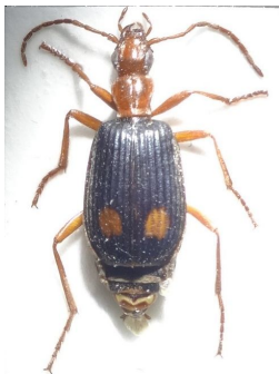
Figure 3: Habitus of Brachinus (Cnecostolus) bayardi Dejean, 1831, dorsal view.