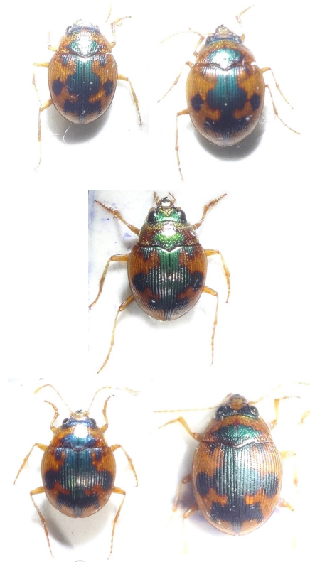
Figures 4-9. Habitus of Omophron , dorsal view: O. rotundatum Chaudoir, 1852, typical form. and southern population.

– Median lobe of aedeagus longer and downward pointing, apical part of aedeagus longer and wider as in Fig. 10..... ..... O. rotundatum Chaudoir, 1852