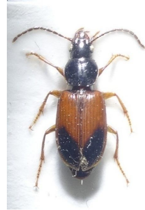
Figure 21. Habitus of Stenolophus (Stenolophus) steveni Krynicky, 1832, dorsal view.