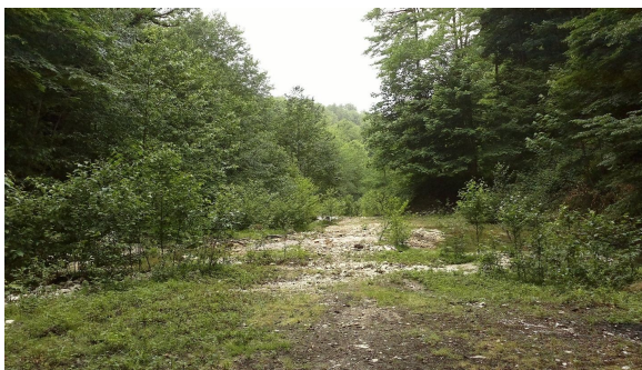
Figure 22. Mazandaran province, Nowshahr city, Khirood forest (36°55'58.10"N, 51°49'28.02"E), deciduous forest, small stream, 23.V.2012.