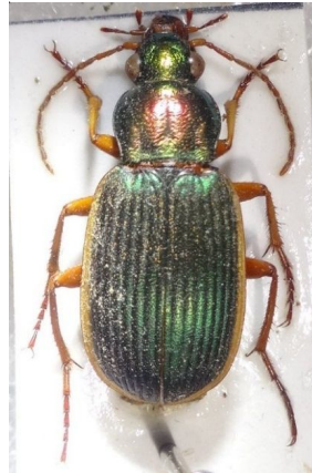
Figure 20. Habitus of Chlaenius (Chlaenius) festivus festivus Panzer, 1796, dorsal view.