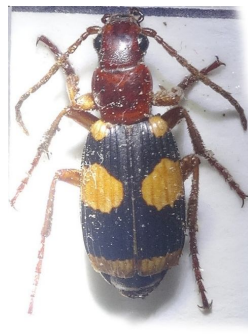
Figure 2. Habitus of Pheropsophus (Stenaptinus) catoirei (Dejean, 1825), dorsal view.

on the pronotum of some specimens reaches the margin of the pronotal base, or the elytral pattern is not interrupted in the middle, as in O. limbatum Fabricius, 1777. However, the aedeagus shows that this population should be referred to as O. rotundatum Chaudoir, 1852 (Fig. 10-13).