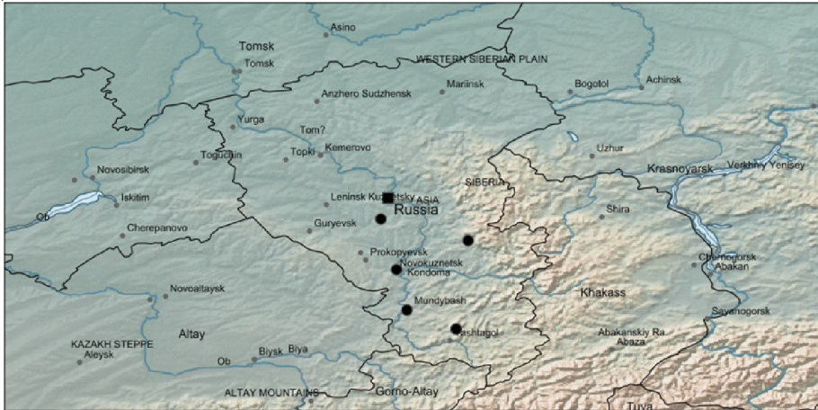
Fig. 16. Map of localities of Neohypdonus tumescens (■) and Selatosomus songoricus (●)