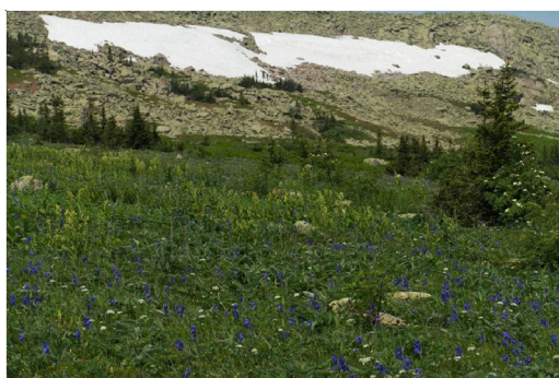
Fig. 14 Habitat of Pseudanostirus vicinus Gurjeva, 1984 and Sericus brunneus brunneus (Linnaeus, 1758)

ZMMU); Polutornik, meadow, 8.VII.2009, T. Akinshina leg. (1 spec.; KSU); Verkhnyaya Ters` guarding point, bank of Verkhnyaya Ters` riv., 11.VII.2009, AK leg. (1 spec.); Kuznetsk Alatau, Tisul distr., mouth of the Bezymyanka riv. of the right tributary of Kiya riv., bank, floodplain meadow, 10-14.VII.2010, F.A. Budaev leg. (1 spec.; KSU).