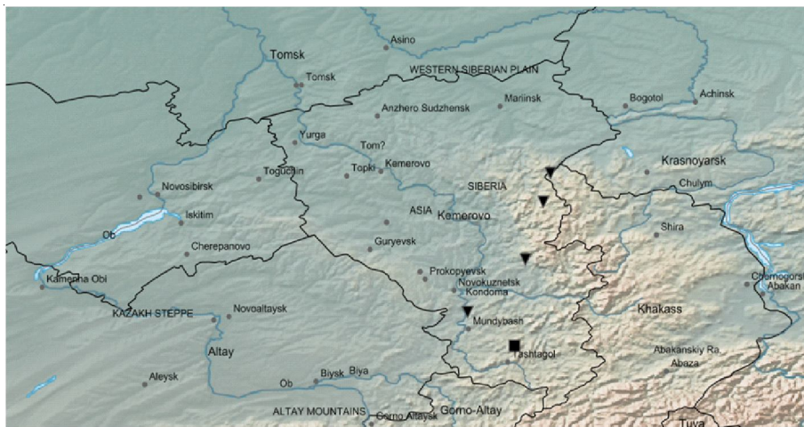
Fig. 17. Map of localities of Oedostethus varians (▼) and Pseudanostirus vicinus (■)

Remarks. Cherepanov (1957), in his monograph on the click-beetles of Western Siberia, distinguishes C. discicollis from other closely related species of the region by the bicolor body. In fact this is true only for the females of this species. Males of C. discicollis have unicolor black body except reddish legs and antennal joints (Chassain 1983; Dolin 1988).