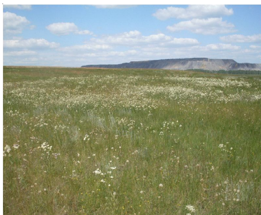
Fig. 13. Habitat of Cardiophorus ebeninus (Germar, 1824) and Limonius poneli Leseigneur et Mertlik, 2007