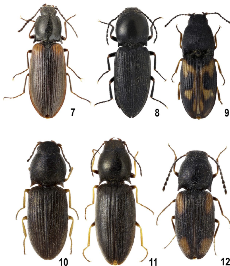
Fig. 7 - 12. Elateridae spp., habitus. 7 - Pseudanostirus vicinus , male, (8 mm); 8 - Cardiophorus ebeninus , male, (6,9 mm); 9 - Negastrius pulchellus , female, (3,7 mm); 10 - Oedostethus minutulus , female, (3,3 mm); 11 - O. tenuicornis , female, (5 mm); 12 - O. varians , male, (3,7 mm)