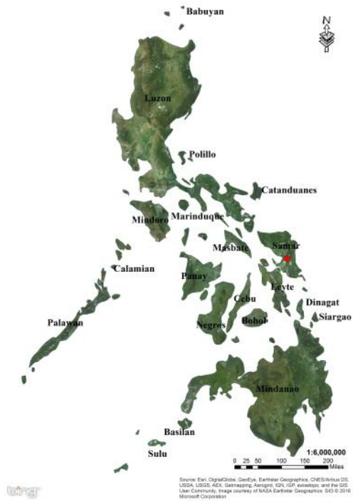
Fig. 9. Distribution of Acronia principalis