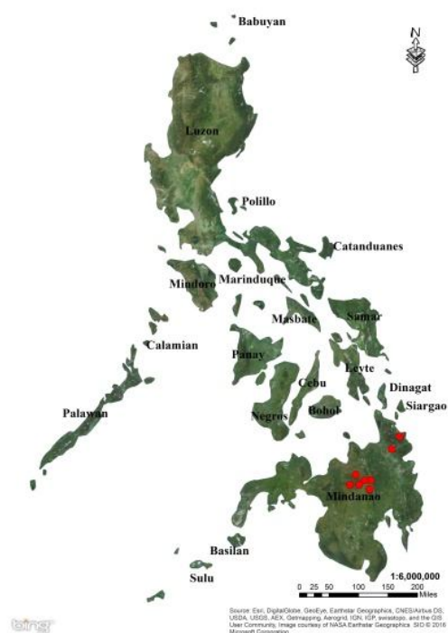
Fig. 8. Distribution of Acronia gloriosa

Mindanao. The distribution of Acronia 'gloriosa' species complex ranges from Samar to mainland Mindanao follows the Greater Mindanao PAIC with no species of this group reaching nearby islands such as Luzon or Cebu. It can be inferred that this group has diversified only recently not more than one million year ago as evidenced by its exclusive distribution in Greater Mindanao since the extensive PAIC formation only took place in the late Pleistocene (Hall 1998, Su et al., 2014). Acronia 'gloriosa' species complex is widely distributed in different localities in mainland Mindanao although high number of species is found in Bukidnon which is considered as the center of the diversity of some