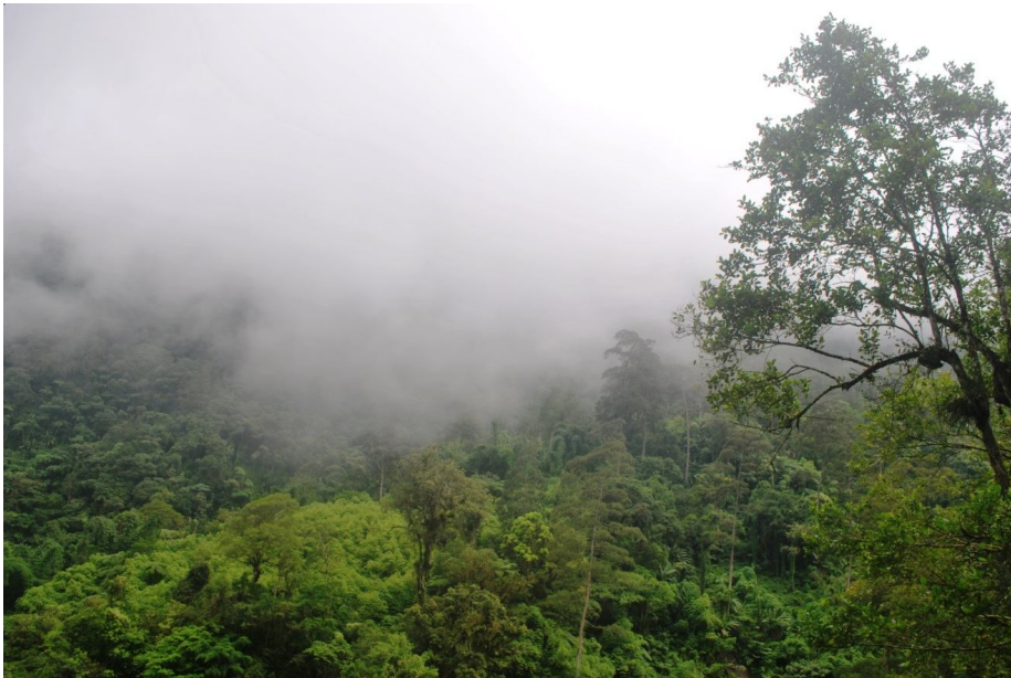
Fig. 7. Habitat of A. superba in Mt. Apo Natural Park

The specimens of the genus Acronia were collected in primary and in secondary forest. The most species were obtained along the trails of mountainous or forested habitats such as Mt. Apo Natural Park (Fig. 7), Mt. Parker, Mt. Kitangland, Impalutao in Bukidnon highlands. These beetles have a high association with forested habitats but seem to tolerate and still thrive in fragmented forested microhabitats, for example as A. pulchella , which was collected in the forested microhabitat in Musuan Town, Bukidnon. The representatives of this genus do