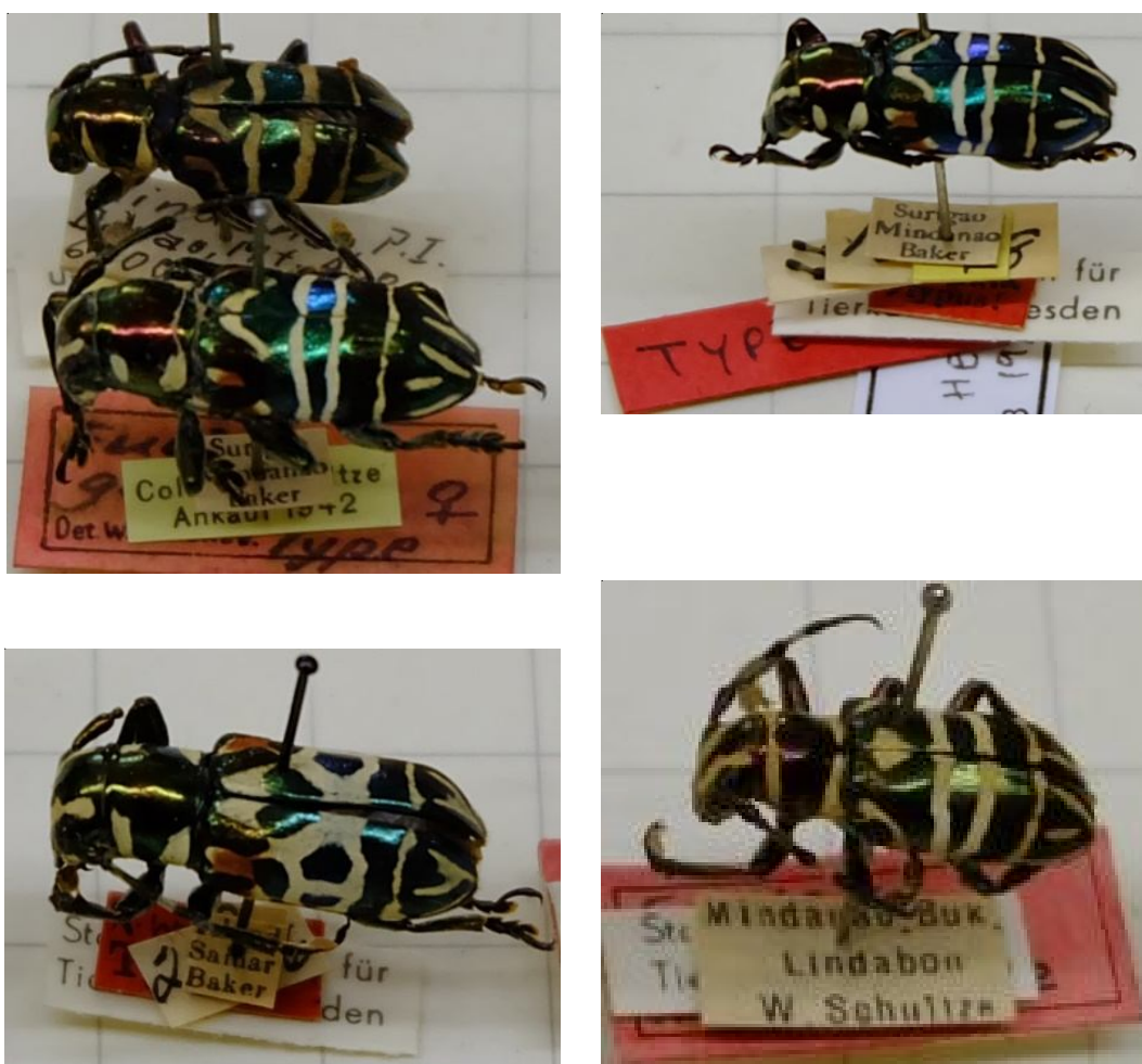
Fig. 6. Examined type specimens of Acronia 'gloriosa' species complex, deposited in SMTD: A - Type of A. gloriosa ; B – Type of Euclea opulenta Heller; C – Type of A. principalis ; D – Type of A. pulchella

(1), 09.2016 (4); Davao del Sur, Mt. Apo, 07.2013 (2), 10.2013 (1), 11.2013 (6), 12.2013 (2), 01.2014 (2), 02.2014 (1), 04.2014 (2), 05.2015 (1), 09.2015 (5); Mt. Apo, Cotabato, 10.2013 (1); Mt. Apo. Kidapawan, 05.2014 (1), 09.2014 (1); Mt. Apo. Mandarangan trail, 11.2015 (1). Mt. Kitanglad, 08.2016 (7); Mt. Parker, 07.2013 (1); Sibagat, 06.2016 (1); Surigao del Sur, 03.2012 (5), 07.2013 (1); Sarangani, Kiamba, 01.2016 (1), 04.2016 (1); Surigao del Sur, Lanuza 05.2014 (1), 06.2014 (1).