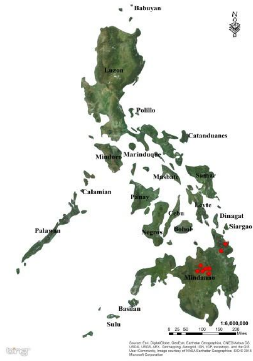
Fig. 10. Distribution of Acronia pulchella