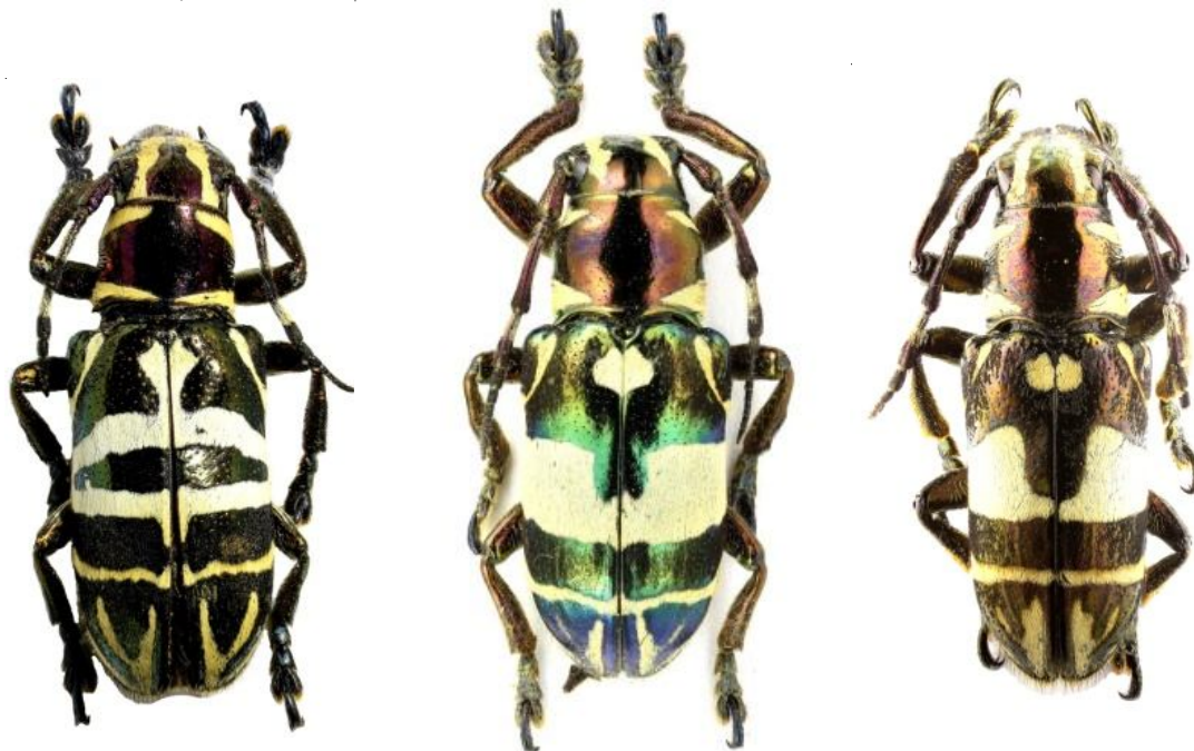
Fig. 3. Habitus of A. pulchella (Schultze, 1922)