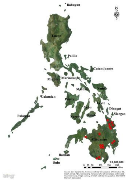
Fig. 11. Distribution of Acronia superba