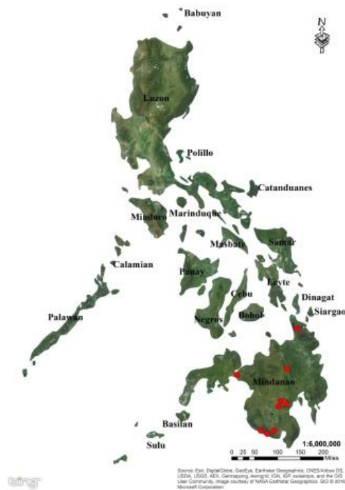
Fig. 12. Distribution of Acronia teterevi