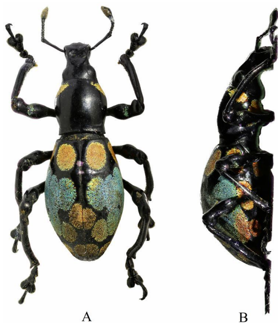
Fig. 2. A - Dorsal habitus of P. disargus sp. nov. male; B – Lateral habitus of P. disargus sp. nov. male