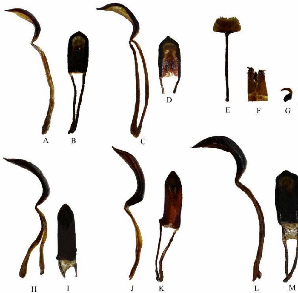
Fig. 4. A, C, H, J, L – aedeagus in lateral view; B, D, I, K, M – aedeagus in ventral view; A, B – P. disargus sp. nov.; C, D – P. congestus ssp. aedamlayroni subsp. nov.; H, I – P. kirkclayroni sp. nov.; J, K – P. sagittatus sp. nov.; L, M – P. tetramaculatus sp. nov.; E, F, G – female genitalia of P. phaleratus ssp. dannylayroni subsp. nov.; E – sternite VIII in ventral view; F – ovipositor in dorsal view; G – spermatheca. Scale bar 1.00 mm

part, from base to submedial part; 2) longitudinal line along lateral margin in all length; 3) two elongated sutural patches at apical part; 4) two roundish patches medially, two roundish patches at apical 1/2; 5) longitudinal stripe from the middle to apical 1/2 along interval IV; 6) triangular patch near apex laterally; elytra widest just in the middle, apex firmly rounded. Metasternum covered