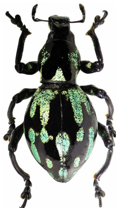
Fig. 3. Dorsal habitus of P. phaleratus ssp. dannylayroni subsp. nov. female

Description. Dimensions: LB: 10.3-10.9 (Holotype 10.5, mean 10.57); LE: 7.1-7.8 (Holotype 7.1, mean 7.37); WE: 4.2-4.6 (Holotype 4.2, mean 4.4); LP: 2.9-3.3 (Holotype 3.1, mean 3.1); WP: 2.7-2.9 (Holotype 2.7, mean 2.77); LR: 1.6-1.8 (Holotype 1.7, mean 1.7); WR: 1.5-1.7 (Holotype 1.5, mean 1.57). N=3 for all measurements.